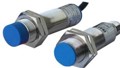
Fig 5: Proximity sensors

Inductive proximity sensor which is use to sense the metal has the operating voltage range of 5v DC to 30v DC. It is 12mm and 18mm in length and has 12mm and 18mm Dia respectably as shown in fig 5. It is used to find out and counter the land mines. Land mines took as to be a metal.