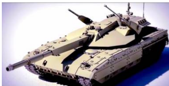
Fig 2: Putin's New WundeWaffe

With increased firepower and protection, these mechanized forces would, only some 20 years later, become the armor of World War II. When self-propelled artillery, the armored personnel carrier, the wheeled cargo vehicle, and supporting aviation - all with adequate communications - were combined to constitute the modern armored division, commanders regained the capability of manoeuvre.