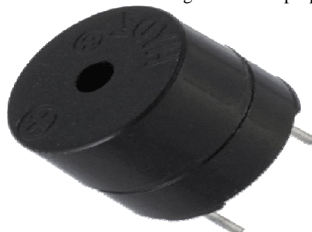
Fig 12: Buzzer

All these sensors being incorporated into a single platform with proper connection to perform the accurate task. The model of tanks is just a prototype with the small range of sensors this same can be done in actual model by using industrial sensors and also the relevant sensors which are using for defense purpose.