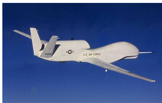
Fig 4: UAV

It is a system which is operated automatically without being the presence of man. This system is often called as Unmanned System. Unmanned system is at the high rate of evolution in the air and space where it is found to be more and more effective and reliable.