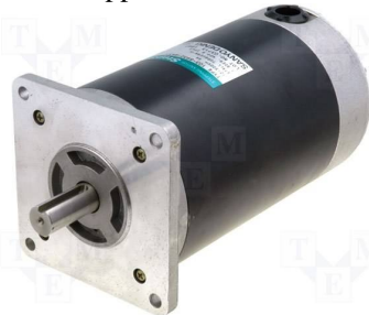
Fig 9: Gear Moto

Gear motor uses to bring tab at the right position and also to move the tank with speed of 100 RPM. It uses only by (5-9) v DC. With the help of Gear motor (fig 9), we can move the tank in the desired position and at desired place due to its unique function.