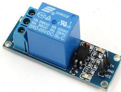
Fig 10: Single Channel Relay

Two kinds of relays are used. Single channel relay shown in fig 10, works on the electromagnetic principle used for interfacing microcontroller with the output fields instruments. Double channel relay shown in fig 11 have the output voltage of 5v dc and used for a drive the motor in 2 directions.