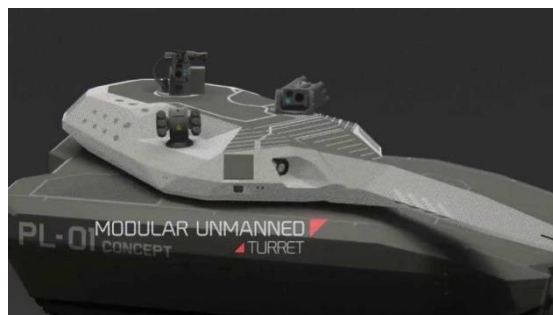
Fig 3: Obrum Advanced Stealth

As the time passes and technology in the world evolves the tanks are also been upgrading since the attack is also getting upgraded. But after a certain period of time manufacturing rate of tanks in certain countries decreases due to certain constraints in the tanks.