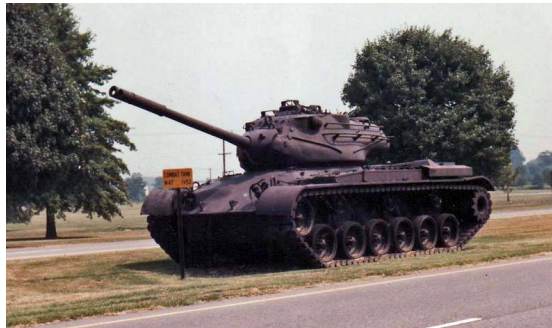
Fig 1: M47 Korean Tank

The tank history was begun during World War-I when armored all-terrain fighting vehicles were first deployed in the war as a response to the problems of trench warfare. Though the tank was unreliable and crude, tank eventually becomes the essential part of the war for ground armies. By World War II, and before the tank design had advanced significantly, and tanks were used in quantity in all land theaters of the war at any time. The Cold War saw the rise of modern tank doctrine and the general purpose main battle tank. The tank still provides the backbone to land combat operations in the 21st century.