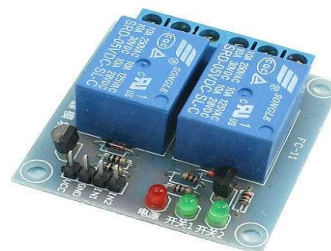
Fig 11: Double Channel Relay

All these sensors being incorporated into a single platform with proper connection to perform the accurate task. The model of tanks is just a prototype with the small range of sensors this same can be done in actual model by using industrial sensors and also the relevant sensors which are using for defense purpose.